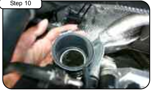
Place 2-1/2" coupler side onto turbo with clamps provided and tighten. (Make sure 2-3/4" side is facing up) Install intake tube from step 9.