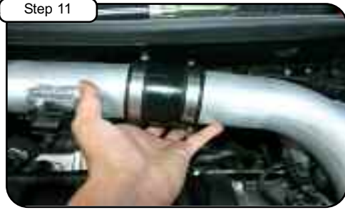
Place 2-3/4" x 3" straight coupler onto other 90 degree tube and install. Do not tighten.