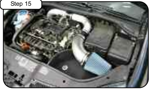
Note: Retighten all connections after approximately 100-200 miles. Your installation is now complete. Check all clamps and hoses periodically. Thank you for choosing aFe!