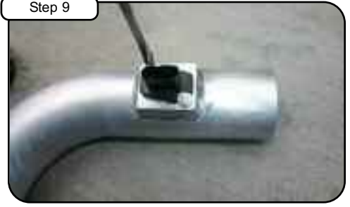
Install MAF sensor into new tube with screws provided and tighten using flat head screwdriver.