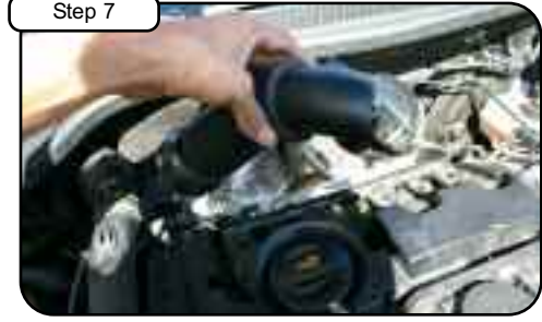
With pliers or channel locks, remove clamp off OE intake tube and remove from turbo. Also make sure OE turbo coupler is removed.