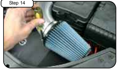
Install Air Filter and tighten using 5/16" nut driver. ( To ensure filter is engaged properly, mark a line 1" from the end of the tube, position filter flange at line and tighten clamp ).