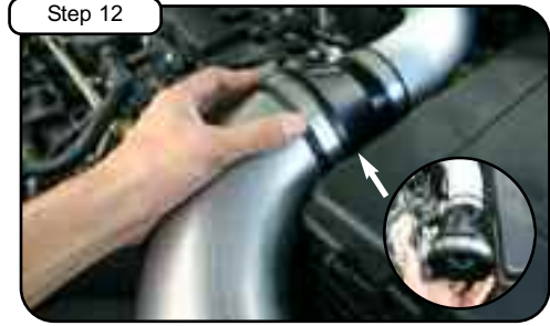
Place 2-3/4" x 4" reducer coupler on 2-3/4" tube side. Place 4" 90 degree tube onto 4" coupler side. Guide tab on 4" tube into isolation mount.