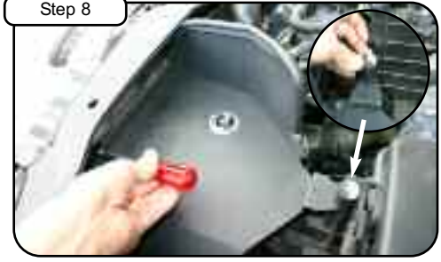
Install trim seal to housing and place into vehicle. Tighten using screws from step 6. Use provided M6 isolation mount to tighten housing down in front of battery.