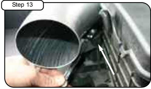
Tighten Isolation mount with M6 nut and washer provided. Make sure tab is on isolation mount. Adjust height and tighten all clamps on intake tubes with 5/16" nut driver.