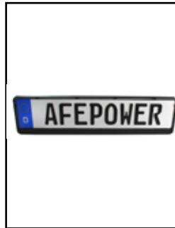
aFe POWER German Lic. Plate