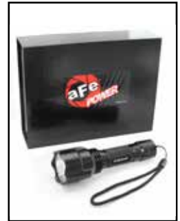
aFe LED Flashlight

P/N: 40-30382 (M) 40-30383 (L) 40-30384 (XL) 40-30384 (2XL)