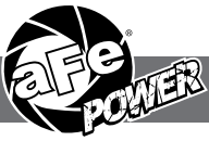
Pro DRY S Air Filter