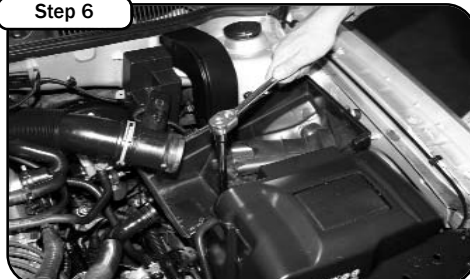
Step 6 Remove the two 10mm bolts securing the lower portion of the air box. Remove the air box.