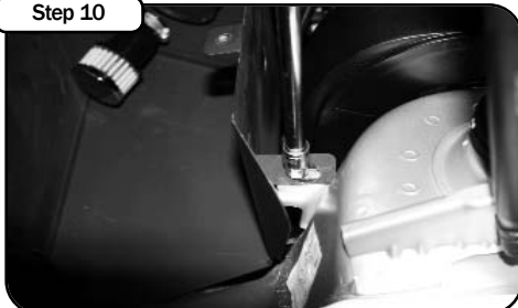
Step 10 Secure the housing to the engine compartment with the supplied hardware.