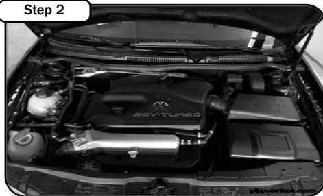
Step 2 Complete stock intake.