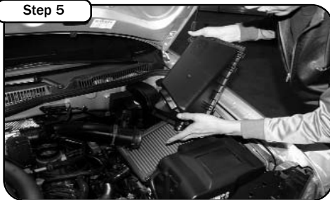
Step 5 Remove the factory air box lid and air filter.