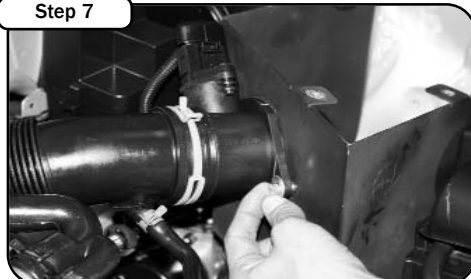
Step 7 Lower the housing assembly in the engine compartment. Secure the MAF sensor to the housing with the supplied hardware.