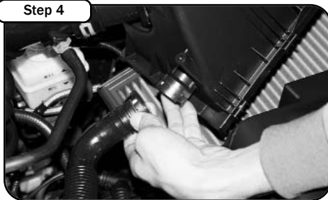
Step 4 Disconnect the smog pump from the air box lid.