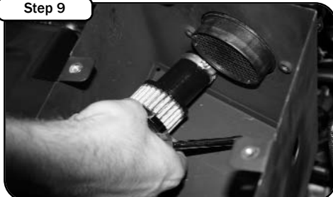
Step 9 Slide the intake breather air filter over the smog pump elbow. Secure with the provided clamp.