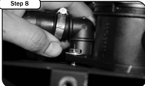
Step 8 Connect the elbow to the smog pump inlet hose. Secure with the supplied mini clamp. Slide the elbow thru the opening on the side of the housing.