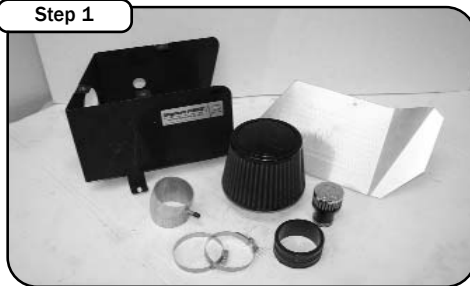
Step 1 Complete kit. Verify all components are present prior to beginning installation.