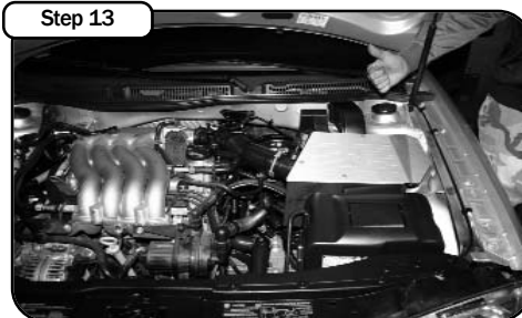
Step 13 Place enclosed CARB EO sticker on a clean/smooth surface or near the intake system. EO identification label is required in passing the Smog Check inspection. Your installation is now complete. Tighten all connections and clamps. Re-check after a few hours.