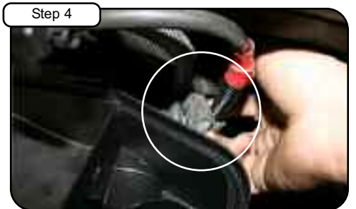
Pull back rubber mount attached to battery cable. Use pliers if necessary. This will allow stock clamp to be loosened. ( To be done in step 5B .)