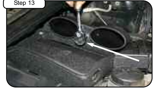
Install screw, washer and wavy washer provided, and tighten with 10mm socket or wrench. Tighten clamps to tube with 1/4" nut driver.