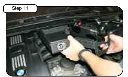
Install housing into factory postion.