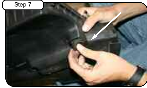
Remove the 3 rubber grommets from the air box. (To be used in step 9.)