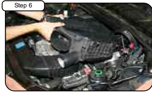
Remove complete air box from vehicle.