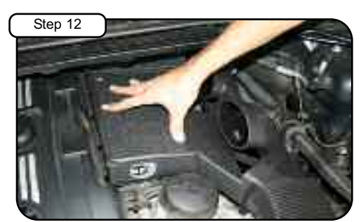
Push down housing allowing grommets to seat. Align threaded insert with hole on housing.