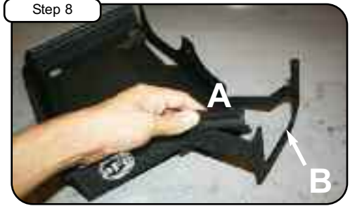
A) Attach 7/16" trim seal to top of housing. B) Attach rubber edge trim seal to ram air cut out on housing.