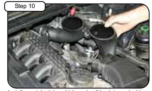
Install new tube into vehicle and pull back towards driver fender. Do not tighten clamps.