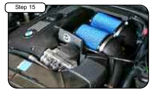
Your installation is now complete. Please check all clamps and hoses periodically and tighten. Thank you for choosing aFe!