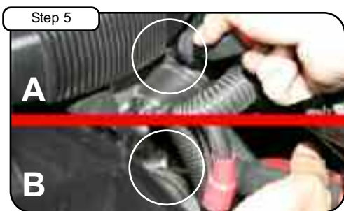
A) Loosen clamp closest to the radiator with 1/4" nut driver. B) Loosen clamp closest to fire wall with 1/4" nut driver. Leave clamps in position.