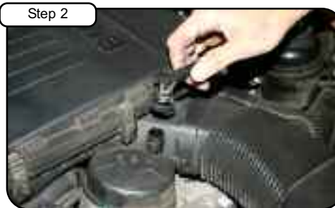
Disconnect vacuum line and pull back.