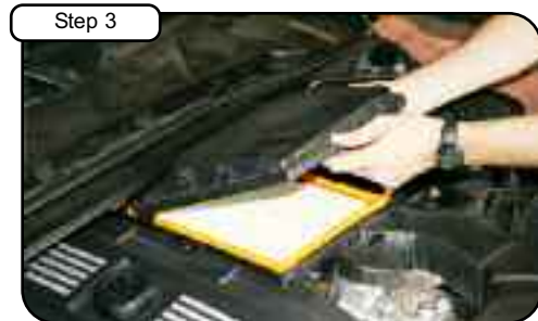
Unclip upper half of air box to remove lid and filter.