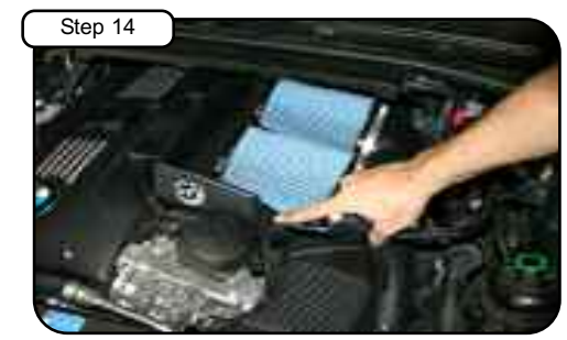
Install air filters and tighten with 5/16" nut driver and connect vacuum line.