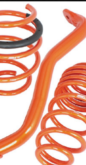
Lowering Kits Sway Bars