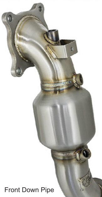
Front Down Pipe